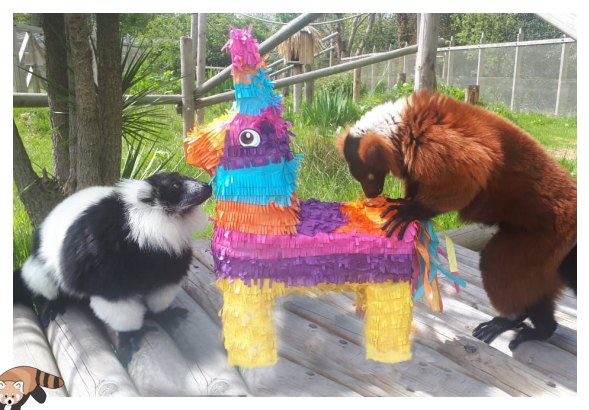
Pinata puzzle for the ruffed lemurs