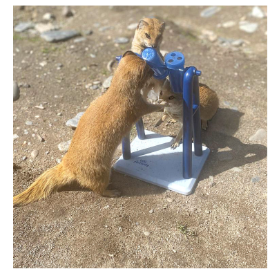
Tricky toy for the mongooses

When we give toys, puzzles and other treats to our animals to keep them busy and interested, it's called " animal enrichment ".